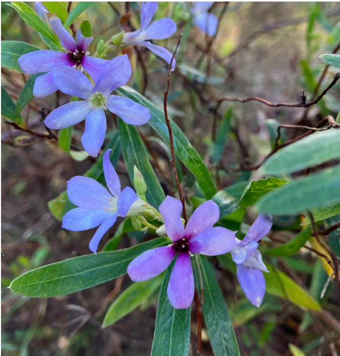
THIS IS NATIVE SWEET APPLE-BERRY Do not remove or poison

It's important to be sure on identification before undertaking control methods. If in doubt, contact your local Landscapes Hills and Fleurieu Stewardship Officer on 8391 7500.