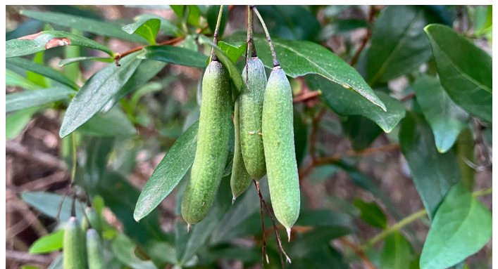
Bluebell creeper flowers and seedpods