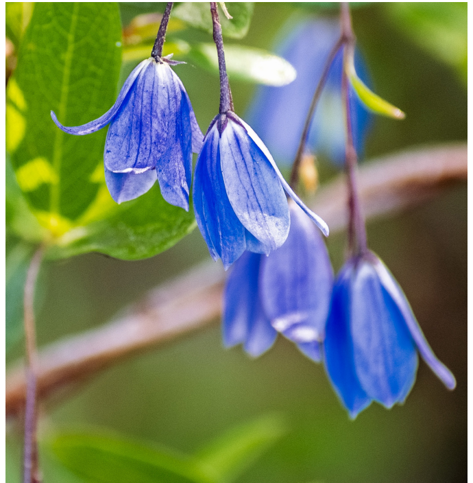
THIS IS BLUEBELL CREEPER Undertake control method on page 1

194 Boards may recover certain costs from owners of land adjoining road reserves