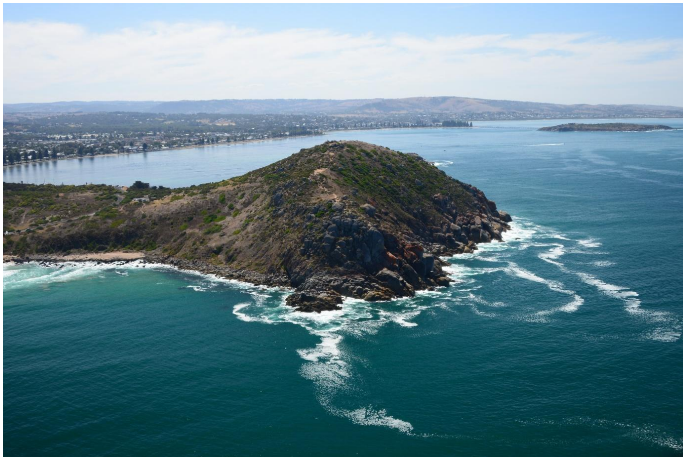
The Bluff, Granite Island Recreation Park, and Encounter Bay (Coast Protection Board, March 2024)