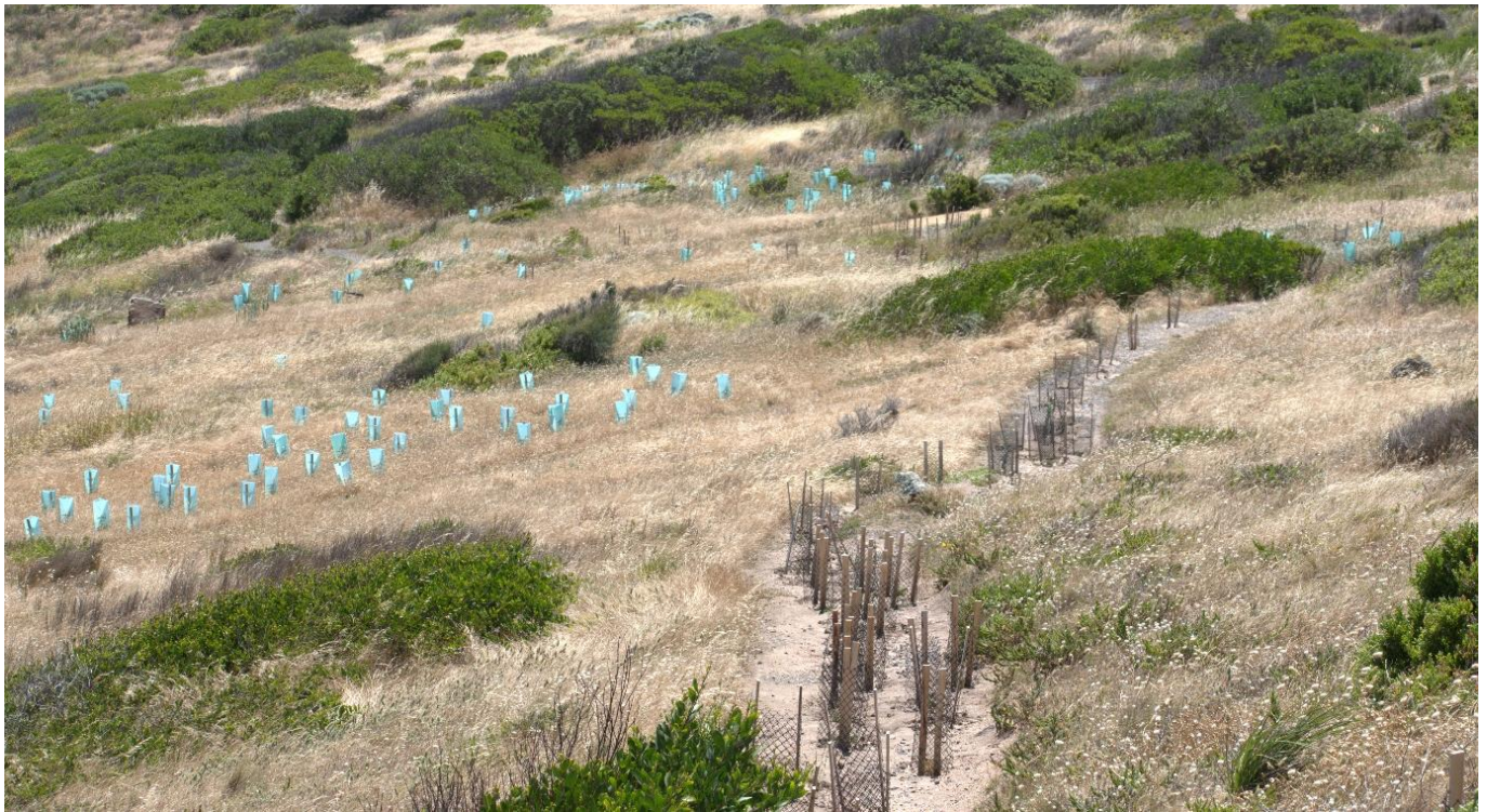
Large areas of The Bluff have undergone revegetation including several tracks that have been closed

Previous revegetation with non-local native species should be removed in a staged-approach and replaced with local plant species. Monitor for spread of non-native species and control new emergences.