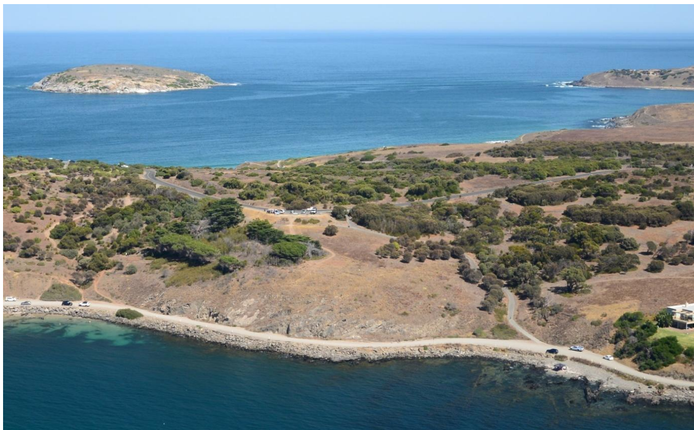
The Bluff with areas of early revegetation, West Island Conservation Park and Kings Head (Coast Protection Board, March 2024)

Areas of high biodiversity value occurring on the eastern and southeastern side of the reserve remain largely intact and whilst some invasive flora and fauna are present, these areas retain a high biodiversity value (City of Victor Harbor 2023).