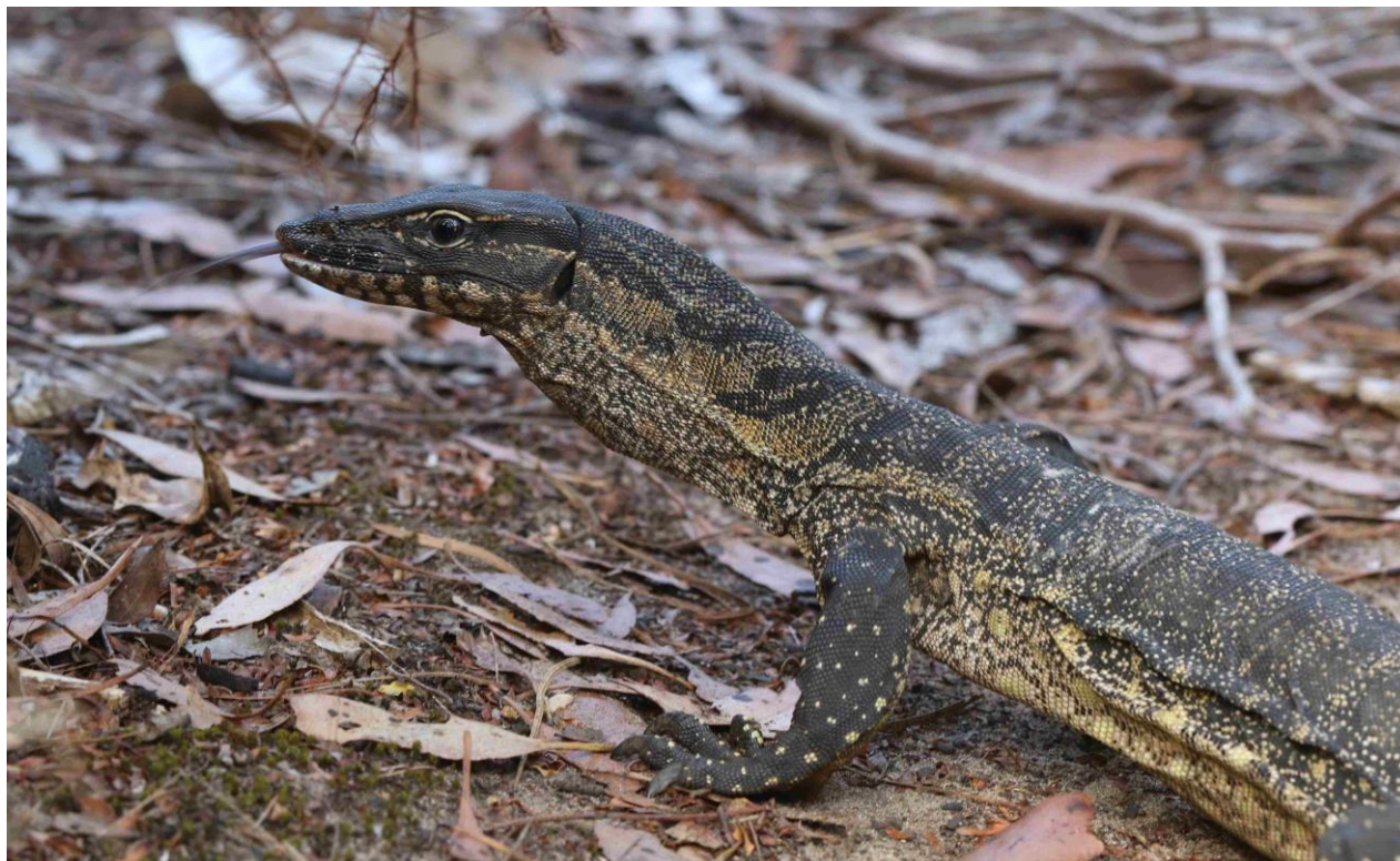
Heath Goanna ( Varanus rosenbergi ) (M Stokes)

present on site. The lack of large trees over much of the reserve may restrict the presence of the Common Brushtail Possum ( Trichosurus vulpecula ) and the Common Ringtail Possum ( Pseudocheirus peregrinus ), although these would likely occur in the vicinity of the reserve. In 2004 a Heath Goanna ( Varanus rosenbergi ) was sighted at the Bluff, a significant record due to its regional conservation rating of 'Critically Endangered'. Cunningham's Skink ( Egernia cunninghami ), which inhabits coastal cliffs, has a regional conservation rating of 'Vulnerable'. This species has been recorded on nearby Wright and Granite Island and is possibly present within the reserve.