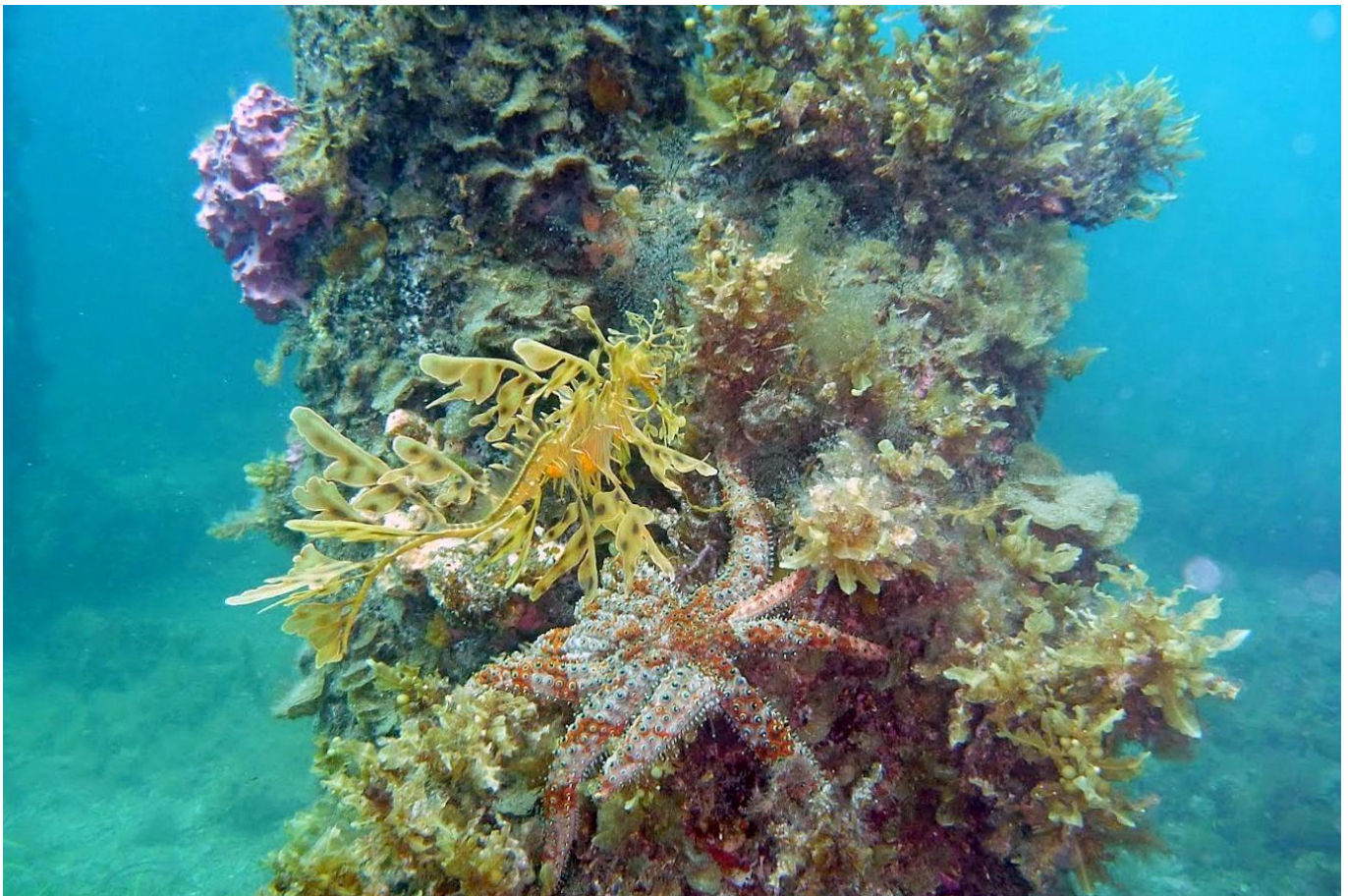
Jetty pilons provide artificial habitat for a range of invertebrates including Eleven-arm seastar ( Coscinasterias muricata ) sponges and sessile species. They also assist with camouflage habitats for Leafy Sea Dragon ( Phycodurus eques ) that is commonly seen in the nearshore habitats of this cell. (M Stokes)

Artificial reefs occur within the cell in the form of a wharf and rock wall at The Bluff. The inshore bare sand is characterised by a low-energy reflective beach system (Short 2001).