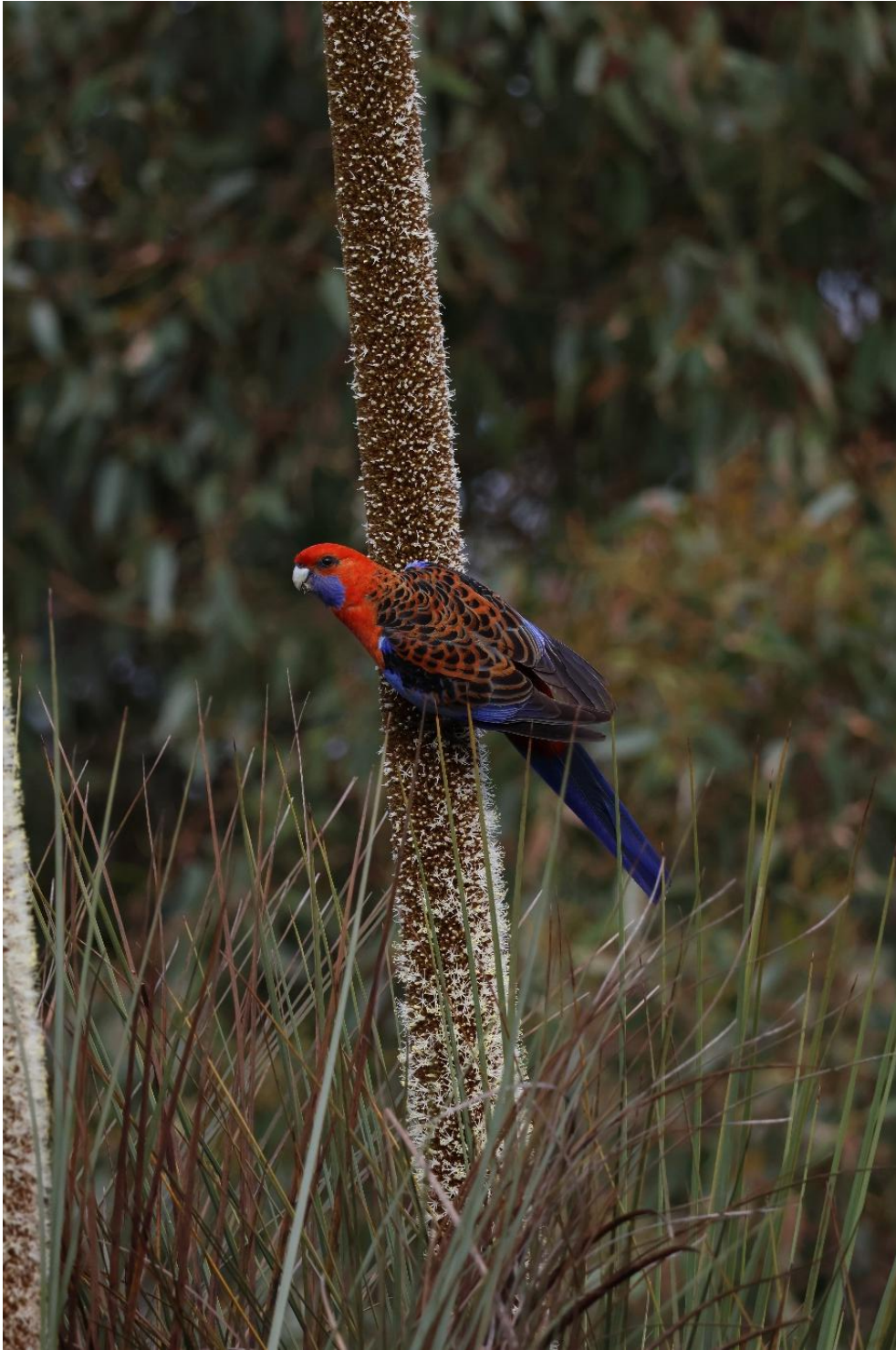
Crimson Rosella (Platycercus elegans) on flower spike of Yacca (Xanthorrhoea semiplana ssp. semiplana) (D Easton)

Flora species of conservation significance in this cell include Native Orache ( Atriplex australasica ), Dark Flat-sedge ( Cyperus sanguinolentus ), Butterfly Spyridium ( Spyridium coactilifolium ), Hop-bush Wattle ( Acacia dodonaeifolia ), White Correa ( Correa alba var. pannosa ), Pale Flax-lily ( Dianella longifolia var. grandis ), Pink Gum ( Eucalyptus fasciculosa ) and Wiry Dock ( Rumex dumosus ). The Lomandra effusa Tussock Grassland on the northern side of the headland is considered significant, but does not satisfy the criteria under the Environment Protection and Biodiversity Conservation (EPBC) Act Critically Endangered listing of an Iron-grass natural temperate grassland of South Australia threatened ecological community, as it is located in a coastal area where the floristic composition is influenced by coastal processes (e.g. salt spray and saline soils) (Turner 2012).