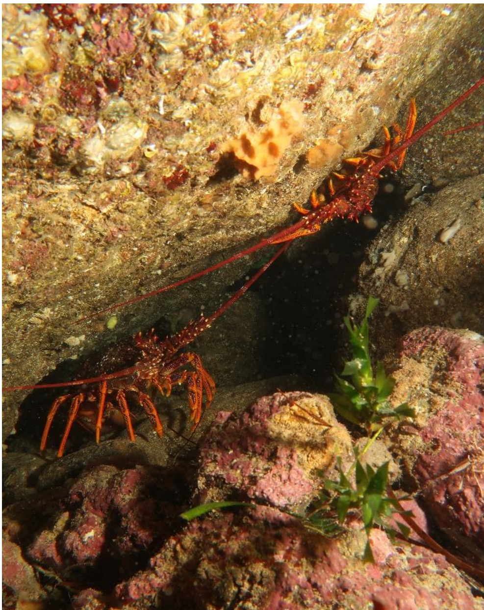
Southern Rock lobster (Jasus edwardsii) is a common recreational fishing species in this cell.

The reef ecosystem baseline study (Brook et al. 2020) and current study by Brock et al. (2023) assessing the trends in the condition of rocky reef ecosystems of the greater Adelaide and Fleurieu Peninsula region found that the overall status of rocky reefs was stable or improving, based on several key indicators of condition (e.g., fish and macroinvertebrate species richness, community structure, large fish biomass, macroalgae percentage cover, and reef thermal index). Results from the Encounter subregion (cells F7-F12) indicate that macroinvertebrate and fish species richness, large fish biomass and the percentage cover of canopy-forming algae has remained stable or is increasing at these sites (Brock et al. 2023). Marine species in the Encounter subregion include 52 bony fish, three shark and ray, 41 species of marine invertebrate, and seven species of crustacean (Brock et al. 2023, Edgar and Barrett (2012), Edgar and Stuart-Smith (2014), Edgar et al. (2020)).