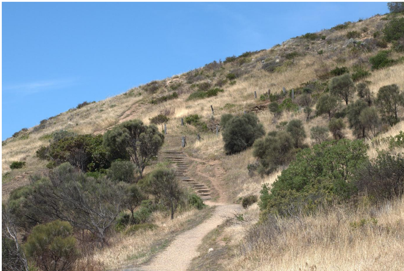
Trails currently traverse the steep slopes of The Bluff and are used by walkers and trail riders as per the tracks seen above (S Rawson)

Guiding principles in the Master Plan that have opportunity to address conservation outcomes and threatening processes include: