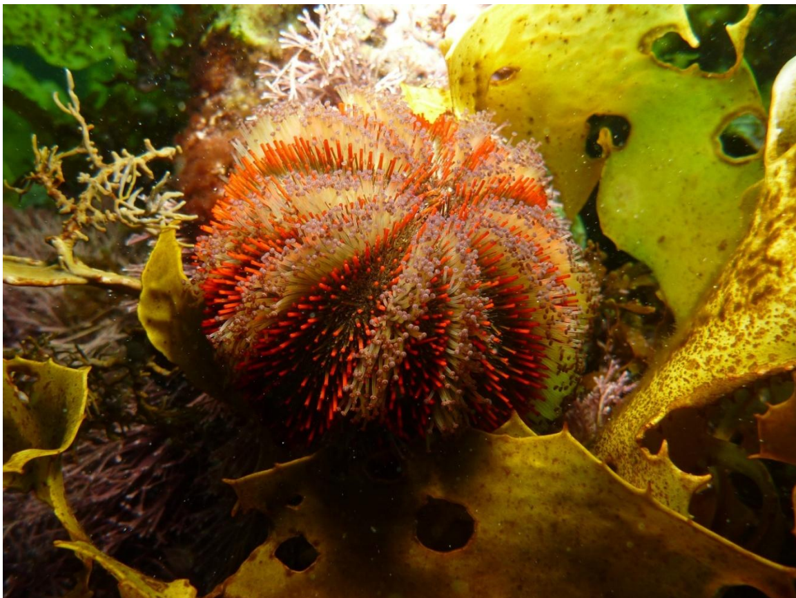
Red-Spined Sea Urchin (Holopneustes porosissimus) (S Bryars)

Surveys of the subtidal reef at The Bluff have found a high diversity of fishes, invertebrates and macroalgae (Haig et al. 2006, Turner et al. 2007, DEH 2008, Baker et al. 2009, Brook and Bryars 2014, Brook et al. 2020, Brock et al. 2023). The intertidal reef at The Bluff has been surveyed for macroalgal, seagrass, mollusc and echinoderm species richness, and is characterised by a range of macroalgae (red, green and brown) and numerous (>30) mollusc species (Benkendorff et al. 2008). The cell lies inside the Encounter Bay region, which is a known ‘hot-spot’ for macroalgal species diversity (see Baker and Gurgel 2010). The Bluff is also a recognised hotspot for the Leafy Sea Dragon, which is associated with the macroalgal reef and seagrass habitats in the area.