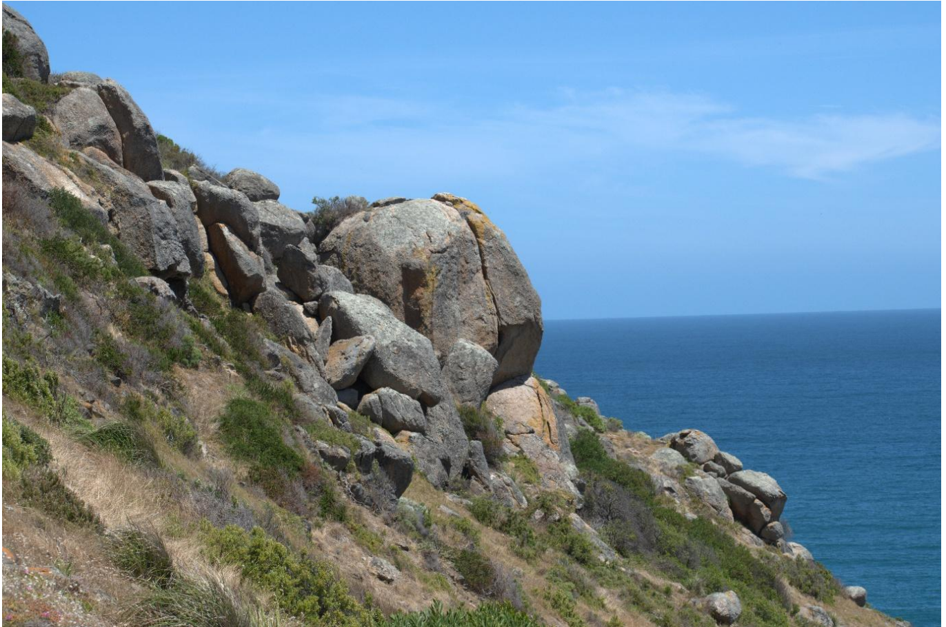
Stormwater management and erosion from steep hillsides are a challenge for land managers (S Rawson)

Planning and Design code zoning in this cell is not reflective of current land use and conservation values as entire cell is zoned Rural.