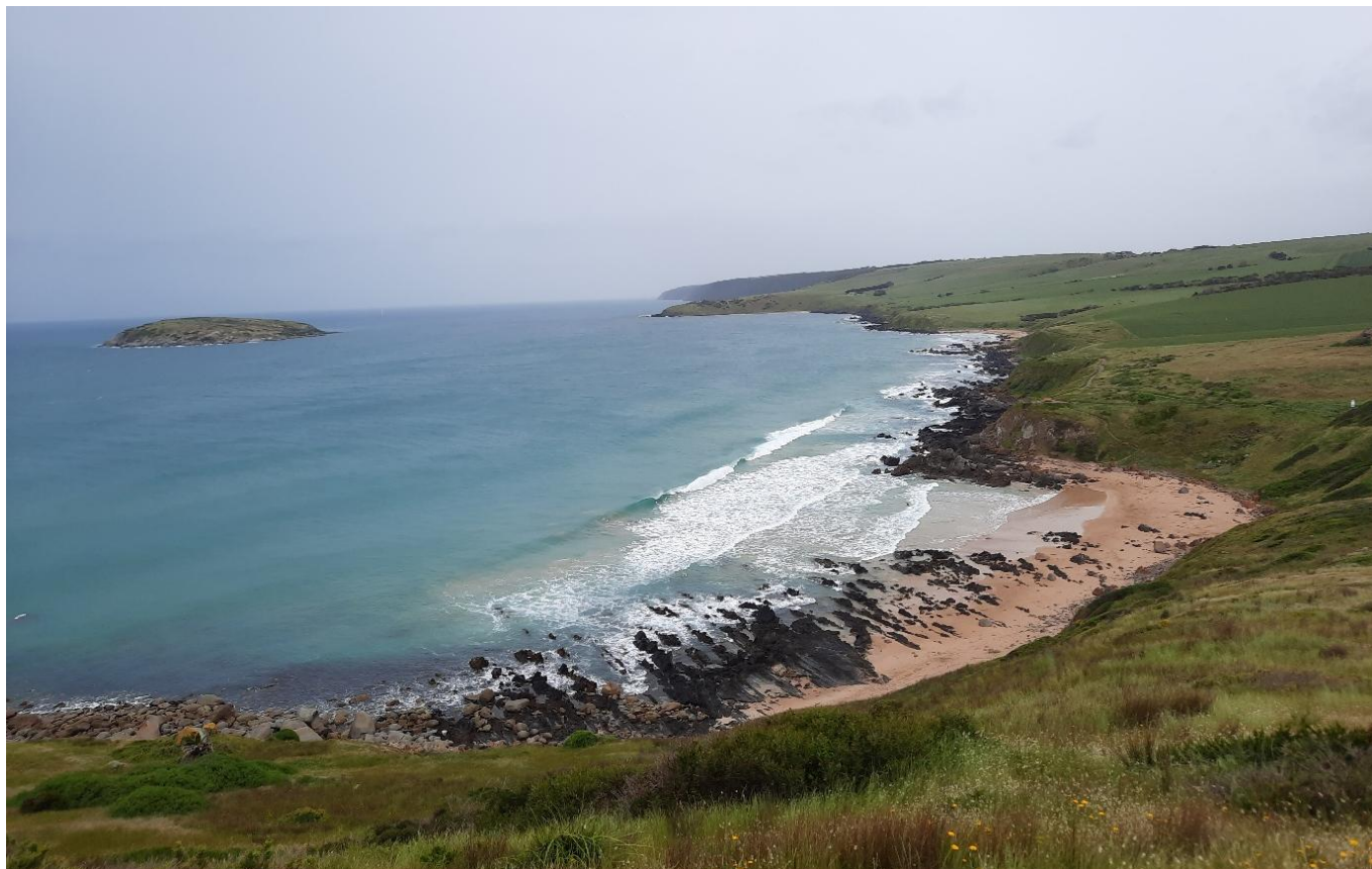
Petrel Cove with rocky shores of geological significance, Wild South Coast Way (Heysen Trail) extends west from above the beach with views of West Island (S Sutherland)

There are pest animal threats to coastal fauna and flora from rabbits ( Oryctolagus cuniculus ), Brown hares ( Lepus capensis ), foxes ( Vulpes vulpes ), goats ( Capra hircus ), and cats ( Felis catus ). Coordinated collaboration between landowners and managers is required to manage pest animals (refer to regional pest management strategies). Historically, rabbits had a major impact on the failure of direct seeding programs, despite an annual rabbit control program.