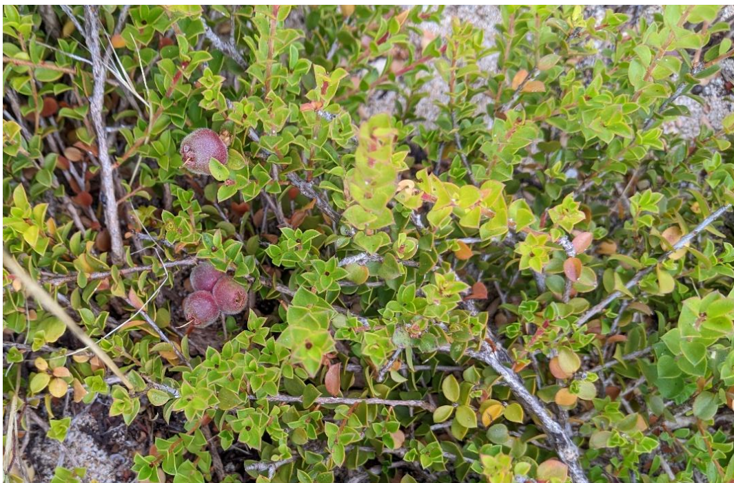
Muntries ( Kunzea pomifera ) is a hardy native groundcover found on the Bluff

Vegetation within associations, particularly on the exposed eastern side of The Bluff have seen substantial recovery since rabbit control has been undertaken, with regrowth of native flora species including Kangaroo Grass ( Themeda triandra ) and Short-stem Flax-lily ( Dianella brevicaulis ). Future pest fauna management should focus on rabbits as a priority, but additional works on controlling the numbers of foxes, hare and goats within the area surrounding The Bluff should also be considered.