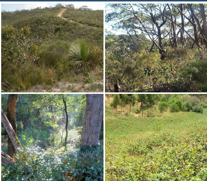
A range of suitable habitats for Bandicoots.

Bandicoot populations are being threatened by loss of suitable habitat, e.g. from human development and overgrazing by kangaroos, rabbits and deer.